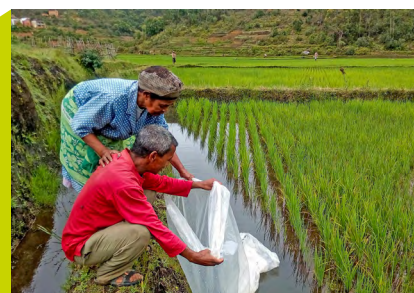
Farmers stock their rice fields with fish.