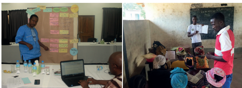
Photo (left): Joint Strategic Planning Workshop involving officials from MLSS, Strategy and Policy Unit (SPU) and EPP III

Overall, the component supports the development and implementation of macroeconomic policy framework meant to link employment with economic growth. This will provide the enabling macroeconomic and sectorial policy environment for more