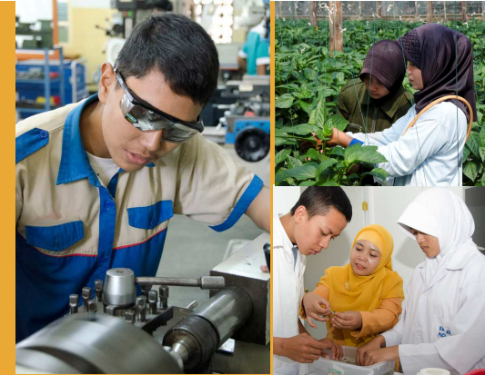
Private Sector Development

The SED-TVET programme is implemented by Deutsche Gesellschaft für Internationale Zusammenarbeit (GIZ) GmbH and Kreditanstalt für Wiederaufbau (KfW) on behalf of the Federal Ministry for Economic Cooperation and Development (BMZ). The Indonesian implementation partners are the Ministry of Education and Culture, the Ministry of Manpower and Transmigration and the Ministry of Industry.