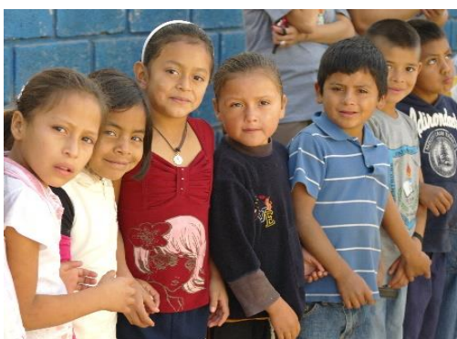
School children and parents from the West of Honduras.