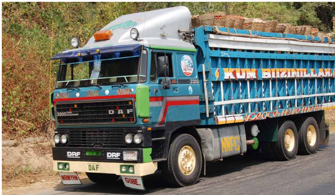
Truck transporting tomatoes, Nigeria

A study conducted in 2013 on intra-regional trade in ETLS approved products shows an increasing trend in intraregional exports among ECOWAS Member States.