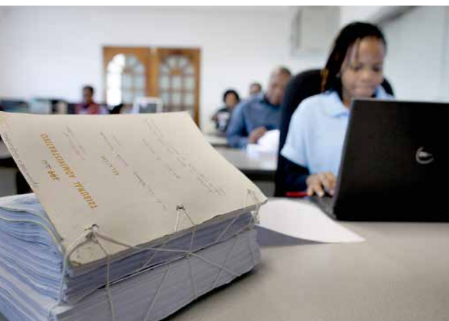
Cotton harvest registration, Benin

The lack of information about regional policies, customs and trade available to responsible institutions as well as to public and private stakeholders has been identified as one of the obstacles to increased trade in the region. Also, issues of communication between ECOWAS and