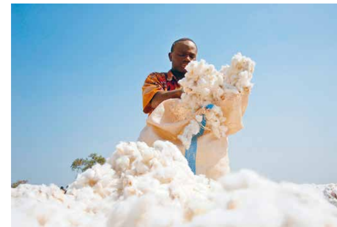
Cotton harvest, Benin

WATIP: Promoting West Africa Trade Integration, project co-funded by EU and BMZ. It is part of the EU-funded programme “Support to Regional Economic Integration and Trade” aimed at integrating West Africa into the global economy and at establishing an effective common market.