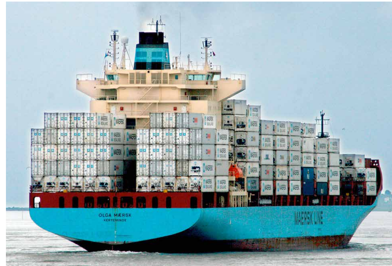
Container Ship Olga Maersk, UK

DEVELOPMENT OF ENABLING FRAMEWORKS: Supporting the extension and the reform of the ETLS by identifying potential gaps of existing regulations and analysing complementary systems of free movement of goods in specific sectors.