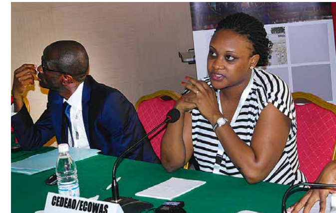
Borderless Alliance Conference, Ivory Coast

The beneficiaries of the programme are the ECOWAS citizens through the ECOWAS Commission, especially its Directorates of Trade and Customs, as well as through the UEMOA Commission. Support may also be directed to other departments of the Commission, like the statistics department, as well as to other regional and national institutions.