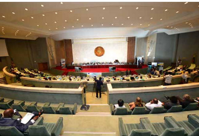
Conference Hall at the ECOWAS Commission, Nigeria

Tariffs form a major income source for state budgets in the most ECOWAS countries. It is important for Member States to diversify their revenue base and reduce dependence on import and export duties. Therefore, Member States should harness alternative sources of revenue, and improve their capacities to generate revenue through internal taxes (e.g. value added tax, excise duties, income tax).