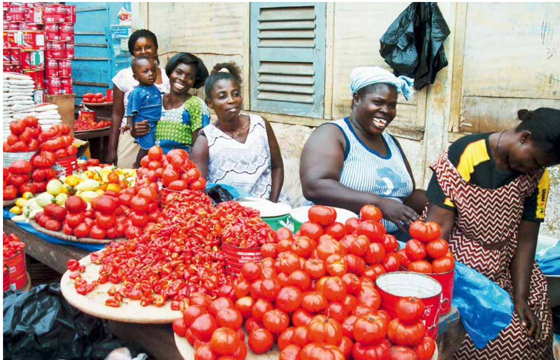
Women traders, Ghana

WATIP aims to strengthen the capacities of the ECOWAS Commission in key areas of regional economic integration. It supports the ECOWAS Commission in accelerating the process of achieving an effective customs union in West Africa. This is instrumental to increase intra- and inter-regional trade, leading to the economic wellbeing of the citizens of West Africa.