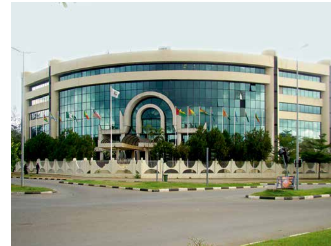
ECOWAS Commission Head Quarters in Abuja, Nigeria

Promoting West Africa Trade Integration (WATIP) is a project co-funded by the European Union (EU) under the 10th European Development Fund and the German Federal Ministry for Economic Cooperation and Development (BMZ). It is implemented by Deutsche Gesellschaft für Internationale Zusammenarbeit (GIZ) GmbH through its Support Programme to the ECOWAS Commission based in Abuja. GIZ is a German federal enterprise that offers workable, sustainable and effective solutions in political, economic and social change processes. GIZ operates on behalf of the German government, other public and private bodies including institutions of the EU.