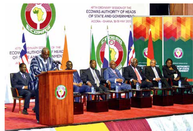
Opening ceremony of the 47th session of the ECOWAS Authority of Heads of State and Government, Ghana

WATIP supports the formulation of a common trade policy of ECOWAS and aims at strengthening regional and national capacities for negotiation and implementation of trade agreements. More generally, it assists the region in the implementation of selected trade agreements.