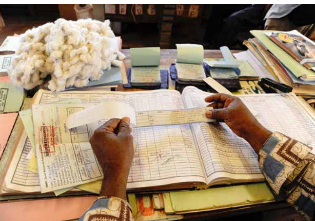
Cotton harvest registration, Benin

With this aim in mind, WATIP supports the region in improving and harmonizing the collection and analysis of regional trade and economic statistics.