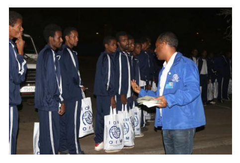
IOM staff member provides post arrival briefing to returnees at Bole International Airport, Addis Ababa in Ethiopia.

In June 2017, BMM facilitated the repatriation of 37 Ethiopians. The migrants had been detained in Kenya for illegal entry and presence in the country. In the hope to find better living conditions, tens of thousands of Ethiopians leave their country every year to find work in the Middle East, Europe or Southern Africa. The 37 Ethiopian migrants entered Kenya through the Moyale border and intended to reach South Africa via the 'Southern Route', transiting through Kenya, Tanzania, and Malawi. The repatriation operation was organised in