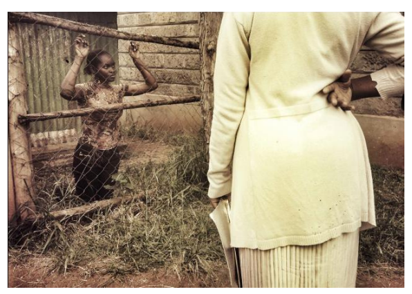
Photo from the exhibition on human trafficking in Kenya.

The story of Pendo is one of the fates publicised on the occasion of the UN World Day against Trafficking in Persons on 30 July in Nairobi. BMM, in cooperation with the Kenyan Counter-Trafficking in Persons Secretariat and with the support from IOM, the NGO HAART and creative experts from PAWA254 (an initiative of young social conscious artists and activists), organised and convened the exhibition. From 28-30 July 2017, the public photo exhibition in front of Nairobi's National Archives shared images of trafficking survivors and their stories with passers-by. The images were interspersed with infographics on human trafficking in Kenya, which aimed at delivering