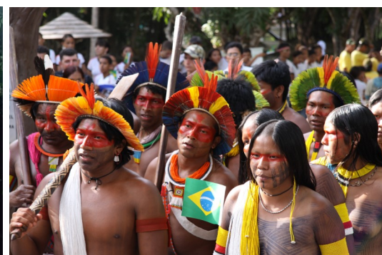
The Brazilian rainforest is home to dozens of indigenous peoples. Compared to the rest of the country, deforestation is very small on their lands