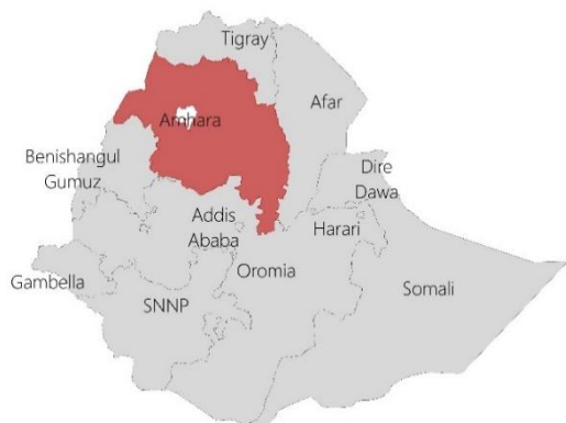
Map of project region in Ethiopia

In Ethiopia, up to 70% of the population is dependent on agriculture, which brings in some 38% of the gross national product. The uplands are densely populated and depending on the region, the average parcel size is 0.25 ha and average farm size is between 1.5 and 2 ha with a trend toward even smaller farms, coupled with a national population growth of 2.6%. The farming of fragmented mini-plots is extremely inefficient, which is why they are known as 'starvation plots'. It prevents the modernisation of agriculture and an accompanying increase in agricultural productivity, which undermines the food security of the households. The Ethiopian Government has recognized the need to encourage farmers to create larger plots by exchanging agriculture parcels. However, there are no laws, regulations or guidelines that regulate land consolidation procedures or stipulate their design. In addition to the unclear legal framework, the responsible authorities at regional level and the private service providers lack in-depth knowledge regarding how a procedure for land exchange or land consolidation can be prepared and carried out using a participatory approach.