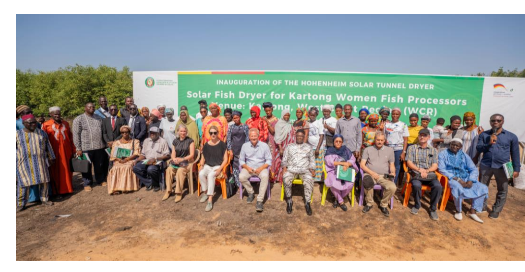
Group photograph of trainees and the Pilot Project Implementation team at the Kartong Fish landing site.