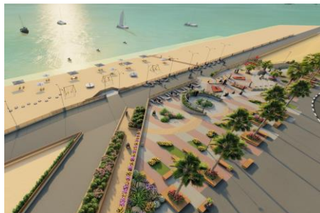
Left: Human-centred design training session in Gaza