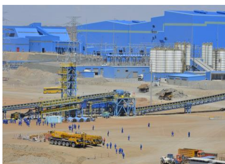
Photo (L) to (R): Engineers at a construction site