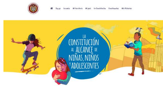
Photo: ‘The Constitution for children and young people’ website, 2023

As part of the Constitutional Court project on The Constitution for Children and Young People, GIZ provided support in creating a special page that appeals to a young audience and is easy to understand. It can be accessed via the Constitutional Court’s website: www.corteconstitucional.gov.co/constitucion-colombia-ninas-ninos/