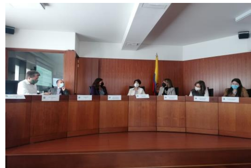
Photo: Courtroom, Constitutional Court, Bogotá, 2021