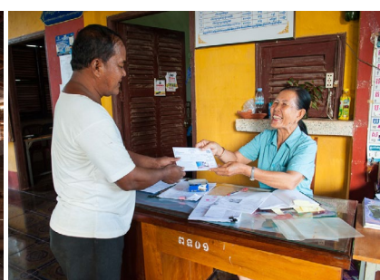
Left Photo: Household Interview being conducted