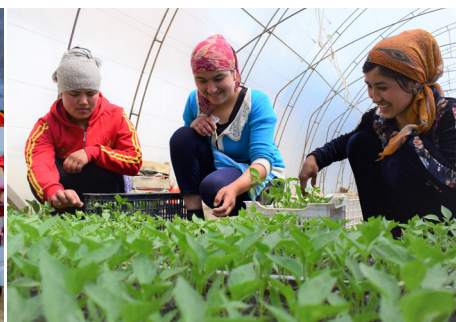
L. to r.: Host of a green touristic destination in Tamga village. Issyk-Kul region.