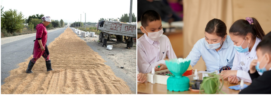
L. to r.: Drying rice during the harvesting season in Batken.