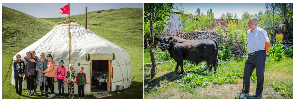
L. to r.: A Kyrgyz family during the season of agritourism. Issyk-Kul region.