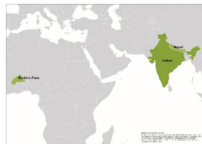
L.: farmer learning to use the farmbetter app; R.: Project Regions