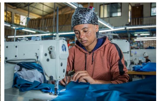
L. to r.: Refugee working in an agricultural business group in Gambella region; Joint business group putting into practice their business idea at a newly established entrepreneurship centre at Ethiopia's first inclusive vocational college; Former vocational training graduate gaining in-company work experience