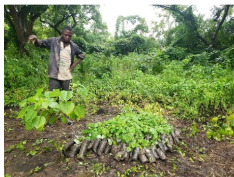
Left: GIZ demonstration field in the commune of Kérou