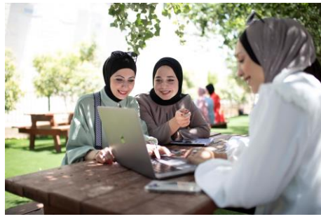
Students of the Dual Studies Programme in Financial Technology at Palestine Polytechnic University

Engineering and Financial Technology). In June 2023, a third programme (Business Technology) was successfully accredited.