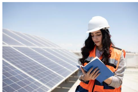
Students of the Dual Studies Programme in Renewable Energy Engineering at Palestine Polytechnic University