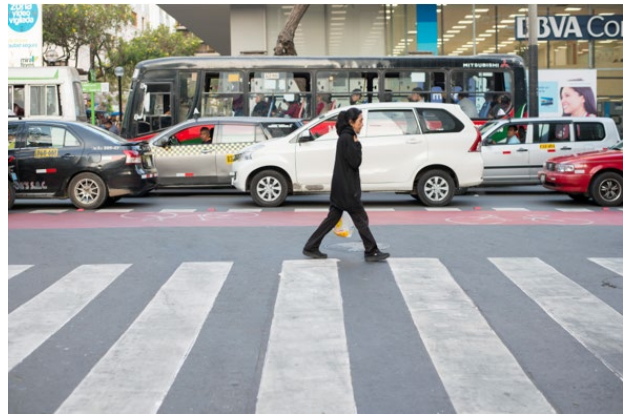
Urban transportation in Lima

For the first time, an analysis of the business models of private transport companies in Piura, Trujillo and Arequipa is available.