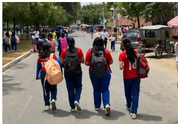
Street near to school in Piura

Project CIMO (Ciudades en Movimiento) supports the cities of Piura, Arequipa, Trujillo. Around 3 million inhabitants benefit from CIMO's support in these cities. At national level, the project works with PROMOVILIDAD, other departments of the Ministry of Transport and the Ministry of Housing, Construction and Sanitation. The project contributes to three NDCs (Nationally Determined Contributions) and SDG 3, 5, 9, 11, 13 (Sustainable Development Goals) of Agenda 2030.