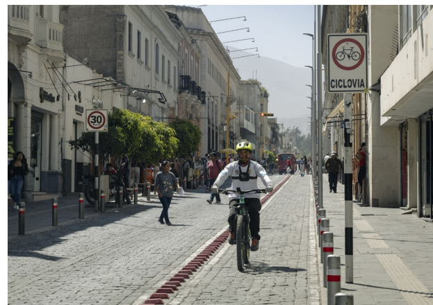
Cycle line in Arequipa