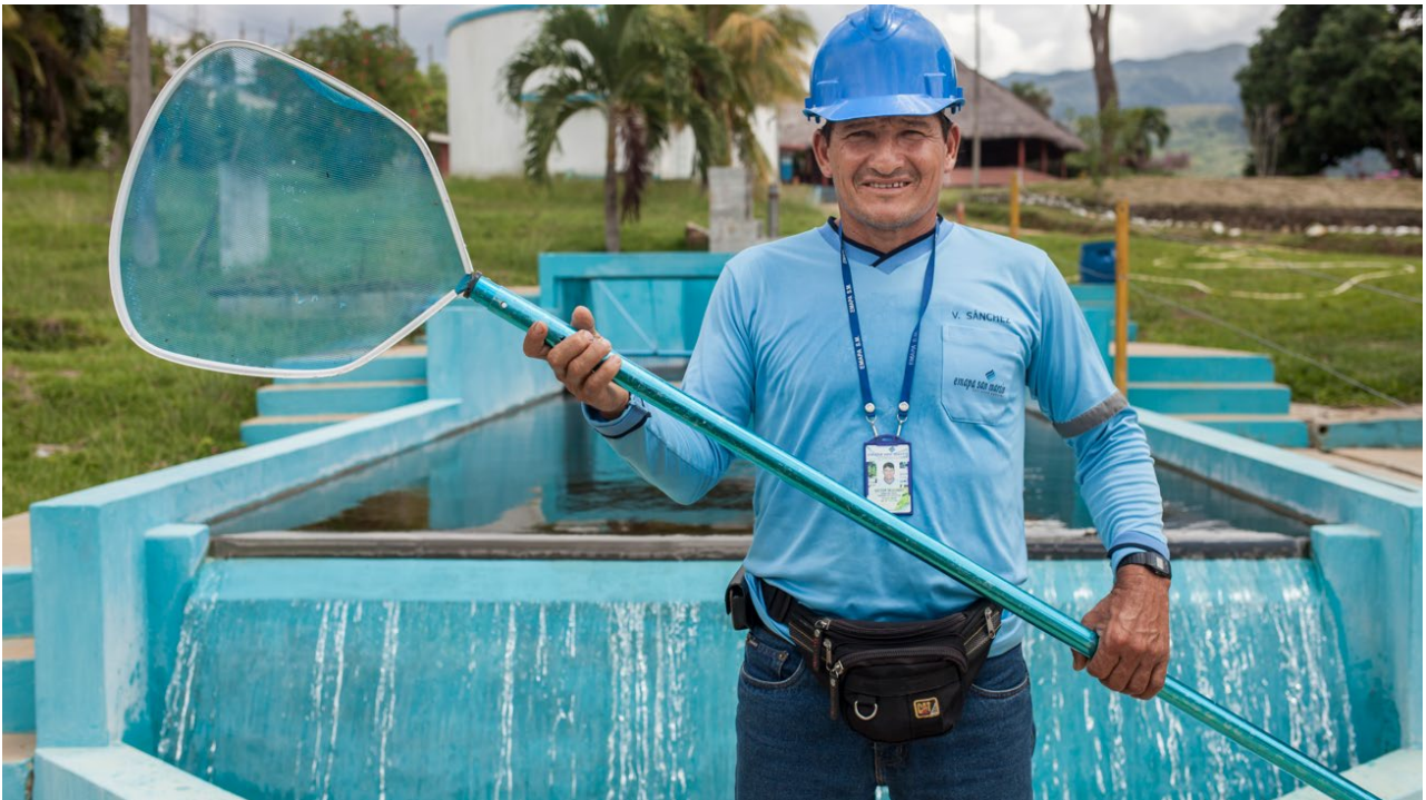
EPS EMAPA San Martín