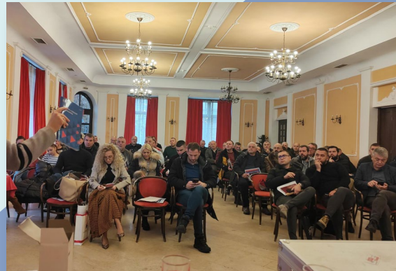
Participants of one of the workshops in Serbia.

Recognising the pivotal role of workers' awareness in safeguarding human rights within their workplaces, experts from the Commissioner for the Protection of Equality, the Agency for the Peaceful Settlement of Labor Disputes and academia equipped the participants with knowledge and skills necessary to identify risks to human rights and possible channels to voice their complaints.