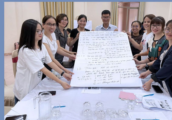
Participants of one of the trainings in Vietnam to prevent sexual harassment in the workplace.

The initiative is a collaborative effort of the IGS, the Vietnam Ministry of Labor, Invalids, and Social Affairs (MOLISA) , and partners including the International Labour Organization (ILO) and Fair Wear that took place during 2022-2023.