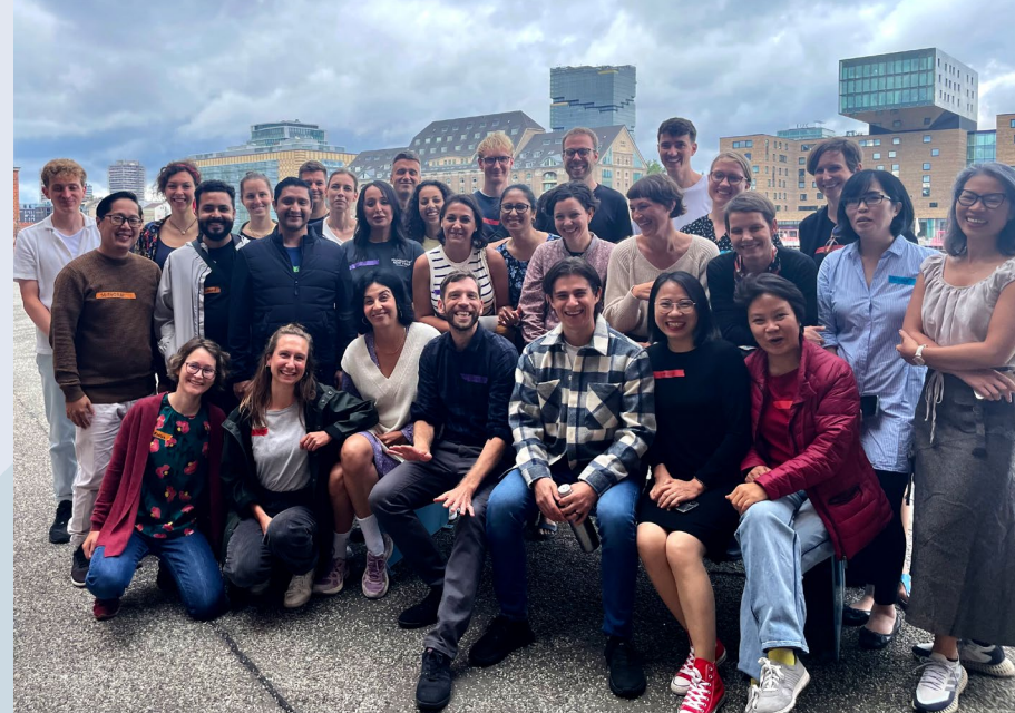
IGS team workshop in September 2023

We are happy to receive your feedback and hope you enjoy browsing through the newsletter.