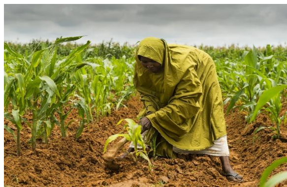
A woman in a field planting

Published by: Deutsche Gesellschaft für Internationale Zusammenarbeit (GIZ) GmbH Registered offices Bonn and Eschborn, Germany Strengthening Capacities for Conflict Transformation and Livelihood for Groups in Vulnerable Situations in Nigeria's Central Zone 12 Charles De Gaulle Close, Asokoro, Abuja T +49 61 96 79-0 F +49 61 96 79-11 15 E info@giz.de www.giz.de