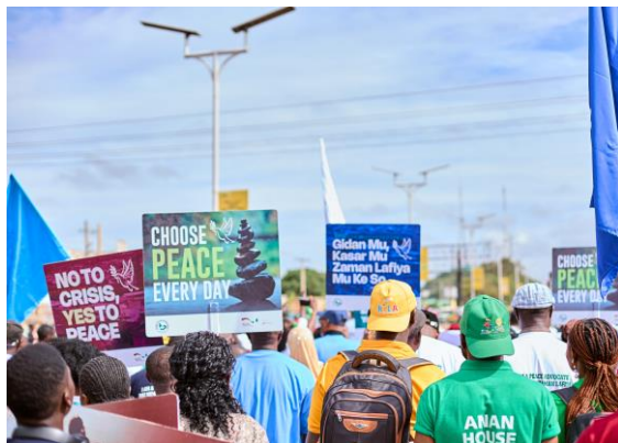
A Peace Walk in Plateau State

Traditional mediation mechanisms that once supported conflict resolution are increasingly ineffective, highlighting the urgent need for inclusive approaches to restore trust, reduce violence, and improve livelihoods across these regions.