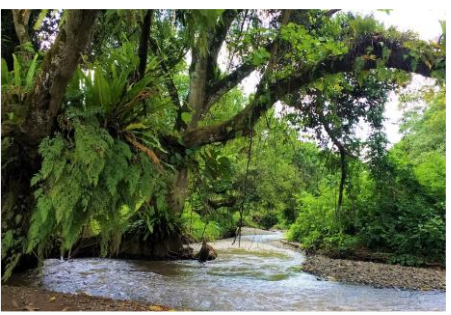
L. to r.: Woman from sericulture cooperative cleaning silk; Forest in Chebera Churchura National Park.