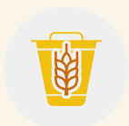
Reduction of food waste