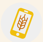
IT and data for food security