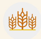
Farming and food production