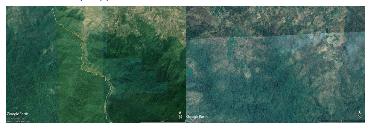
Figure 1: Forest fragmentation and degradation within the landscape area – (a) degradation along international boundary and (b) encroachment into Samlaut MUA