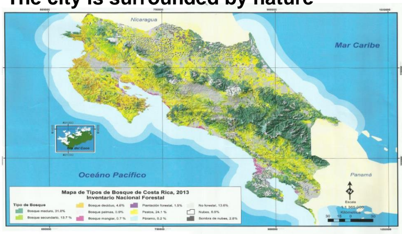
Geographical conditions favor water across city