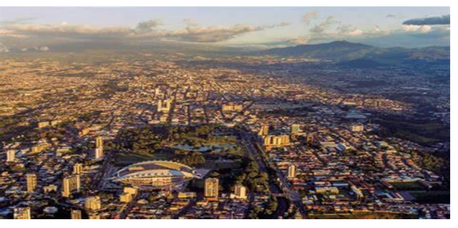
The city is not as green as we would like