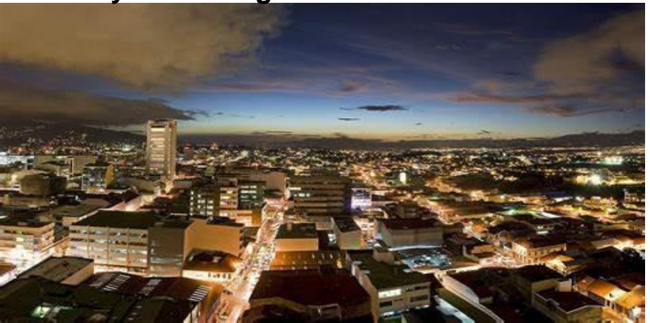
The city is not as green as we would like