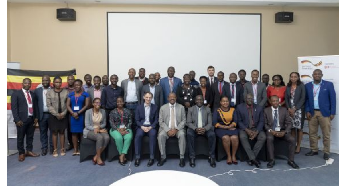
Participants at the Carbon Pricing pose for a group photo during the event

Stakeholders convened at Protea Hotel, Entebbe in mid-February 2024, for a workshop on Carbon Pricing. Their discussion focused on instruments that set a price on carbon emissions as a method to address climate change. During the event, Uganda piloted the Carbon Pricing Incidence Calculator, a tool that facilitates evidence-based decision-making for socially responsible carbon pricing.