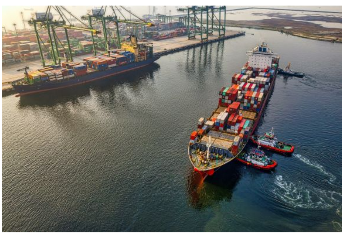
Trade in green hydrogen and Power-to-X products such as green ammonia is only just emerging

What countries can do now to make their regulatory systems fit for the emerging green hydrogen and Power-to-X trade