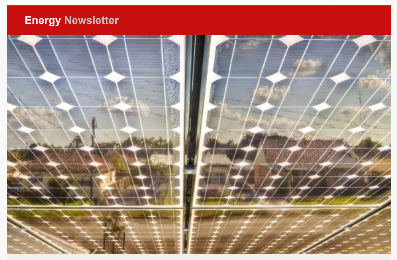
Bimonthly news on GIZ's work on energy and climate protection A service by GIZ Energy