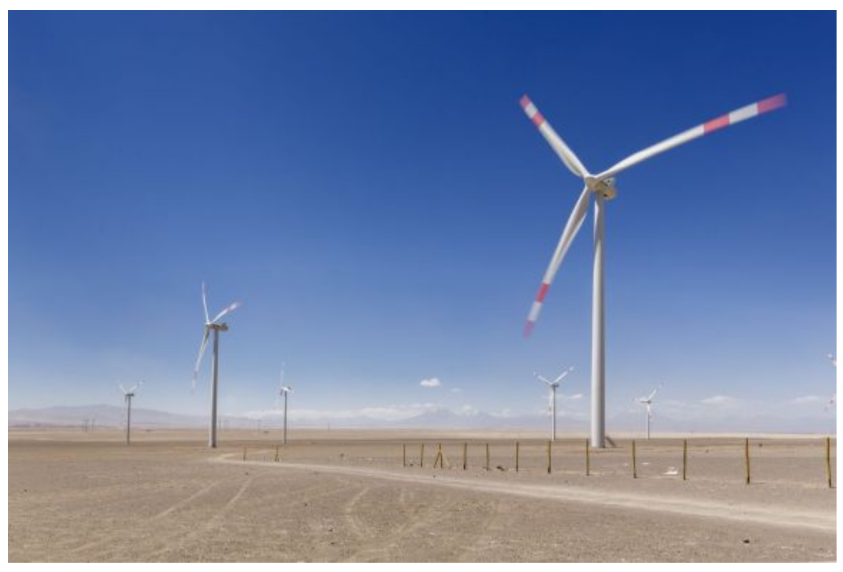
Wind and solar are variable renewable energy sources

Latin America and the Caribbean, Peru, Mexico, Dominican Republic, Chile