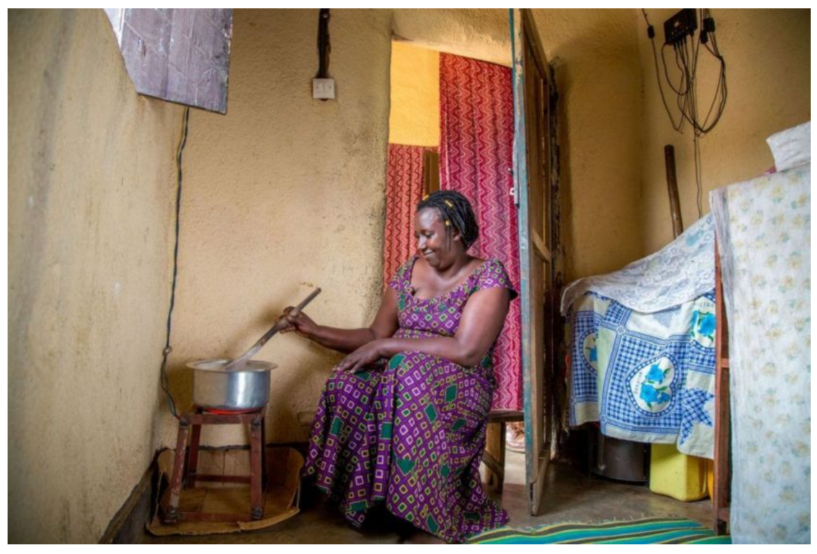
Demand-side subsidies (DSS) can directly reduce the price of energy product for customers

With launches in Liberia and Uganda, EnDev has officially begun implementation of the DSS component. Funded by the Dutch Directorate-General for International Cooperation (DGIS), the DSS component aims to facilitate access to modern energy services (cooking and electricity) by bridging the affordability gap for low-income and/or displaced populations who are not currently reached by commercial markets. The component operates pilots in four countries: Liberia, Malawi, Niger, and Uganda.