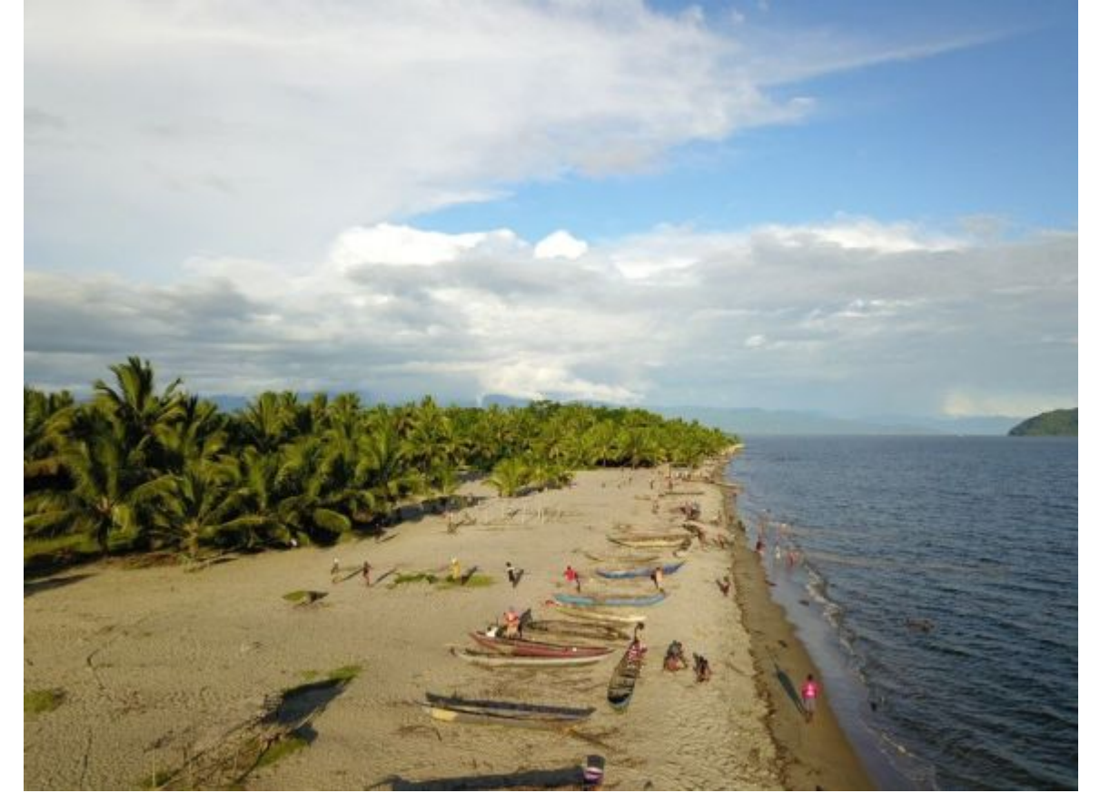
Bay of Antongil

Faced with a low electrification rate of around 30%, the Malagasy government aims for 70% by 2028. GIZ's project "Promotion of Rural Electrification through Renewable Energies (PERER)" assists the Ministry of Energy in implementing an integrated electrification model, IDF, which prioritises universal electricity access at minimal cost. IDF combines decentralised renewable sources (hydroelectricity, solar, biomass, etc.) and several solutions (grid, mini-grids, solar kits, etc.), currently tested in Antongil Bay, aiming for "one territory, one project" expansion. Over 50,000 grid and mini-grid connections, powered by 9.3 MW of solar and hydro energy, plus 16,000 solar kits, are planned, with an 87.2-million-euro investment over 30 years.