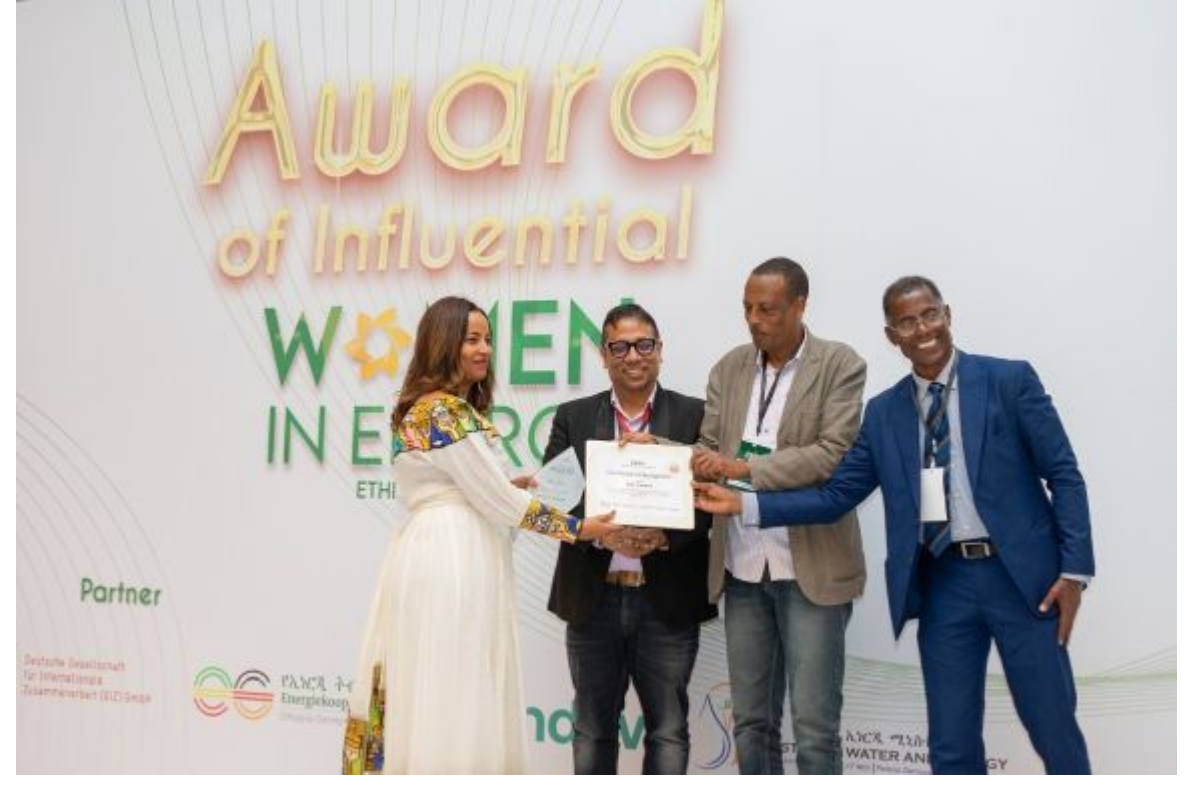
Awarded influential woman photographed with the GIZ-EnDev Ethiopia Programme Project Manager and The Ethiopian German Energy Cooperation Project Manager

We are thrilled to have partnered with the Ethiopian Women in Energy Association (EWiEn) for the exciting Influential Women in Energy Ethiopia 2023 event! It was a celebration showcasing the extraordinary achievements of trailblazing women reshaping the energy sector.