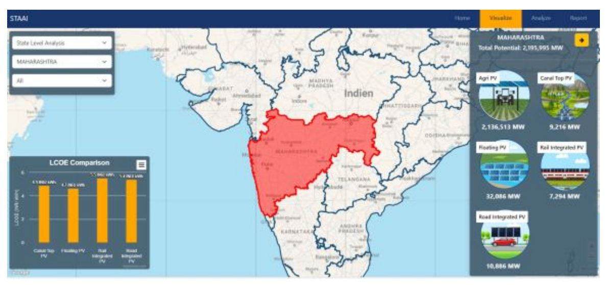
Conducting an exemplary state level analysis in Maharashtra with the STAAI to explore the estimated potential of NISAs

GIZ developed GIS based Solar Technology-Atlas application to carry out technical potential estimation for NISAs in India