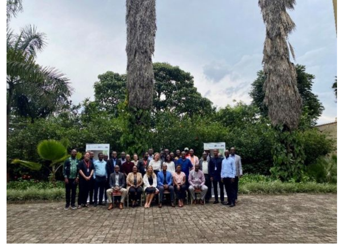
National consultation on the RBF scoring approach

This is the question that GIZ and Practical Action (PA) are exploring as part of a new EnDev project on "Results-based financing for Refugees" (RBF4R). PA is already implementing a Swedish funded project on Renewable Energy for Refugees in and around the camps in Rwanda. Complementing this, RBF4R offers a top-up subsidy on improved cookstoves for the most vulnerable households in a vulnerable population – with the joint aim to make markets work for all. Yet, how to select the eligible households? For this, EnDev designed a scoring approach building on the vulnerability criteria recorded in UNHCR's database. The rationale: The more criteria a household fulfils, the higher the likelihood to be among the most vulnerable. To discuss this approach, PA conducted camp consultations with refugees and local stakeholders followed by a national consultation on the approach. Now, it's time to make it work in implementation.