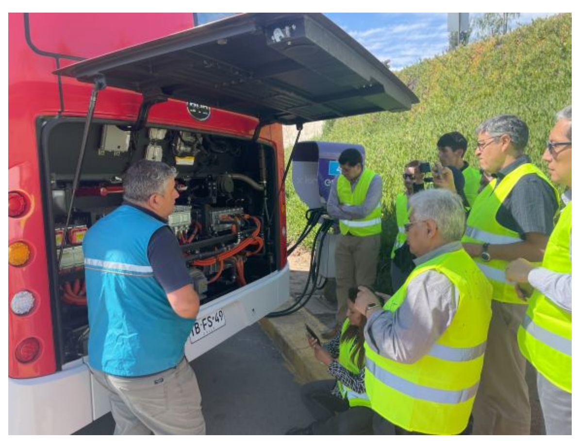
Visit to the electro-terminal Los Espinos METBUS - ENEL-X. Santiago, Chile

With the aim of learning about Chile's experiences in the implementation of electric mobility, and the related actions that allow its adequate development from the public and private sectors, a mission from Bolivia, made up of different government institutions in the electricity sector, made a tour of several entities to learn about their successful experiences.