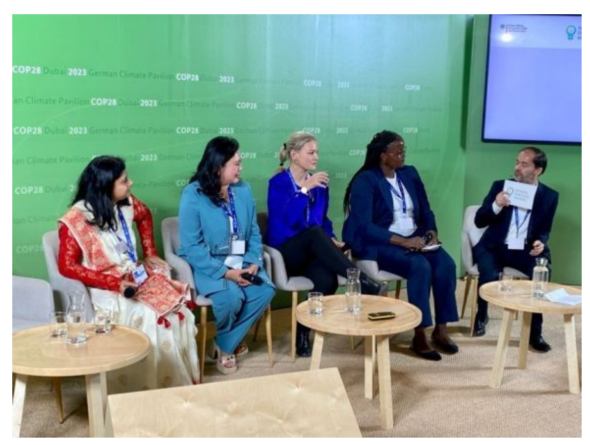
Women Energize Women and Allies panel COP28 on "All in for 1.5°: Accelerating Technologies and Gender Equality in Renewable Energy"

COP28 emphasized the importance of tripling renewable energy by 2030. Utilizing women's currently largely untapped labour power is crucial for this task. While gender was one of the buzzwords at the COP28 – a whole conference day was dedicated to the gender environment nexus – there is still a lot of work to be done. Women continue to be underrepresented in the energy sector, and during the COP28 negotiations women made up only 38% of the party delegations.