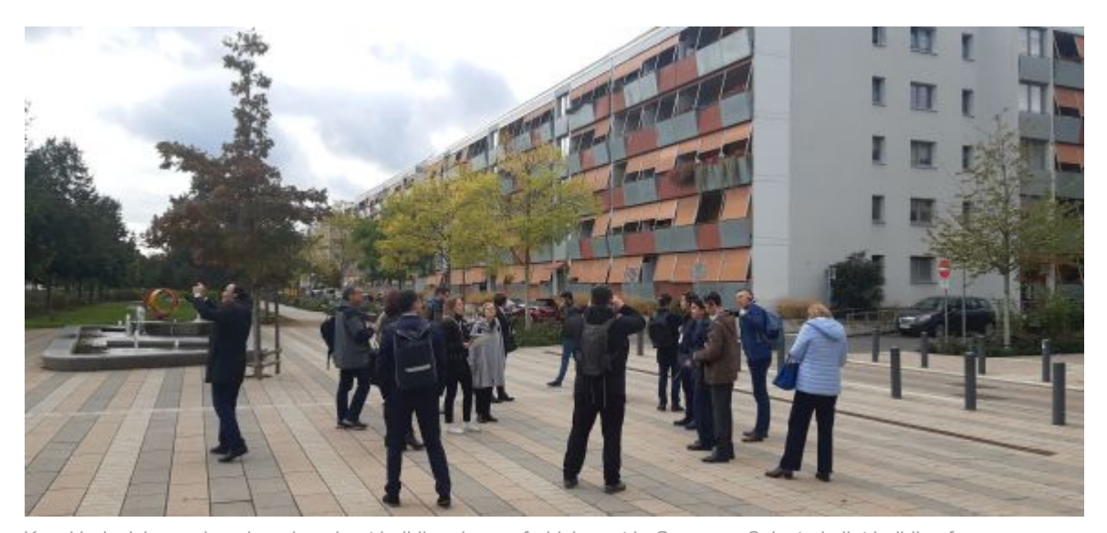
Kazakh decision makers learning about building deep refurbishment in Germany. Selected pilot building for refurbishment in Kokshetau

In Kazakhstan, the building sector is the 2nd most energy intensive sector after industry, with about 40% of the national energy consumption. Approximately 70% of the residential building stock of the country was built between the 1950s and 1980s, and is, therefore, in need of major thermal modernisation. Despite several initiatives, Kazakhstan doesn't have, to this date, full-fledge