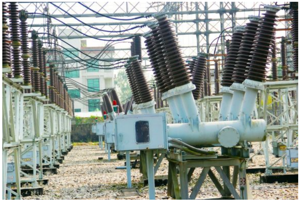
Electric infrastructure

While it is crunch time for protecting the world's climate, one greenhouse gas that has received oddly little attention so far, is the most harmful of them all! Sulphur hexafluoride – or SF6 – has a global warming potential 24,300 stronger than carbon dioxide (over a 100-year period) and remains in the atmosphere for some 1000 years!