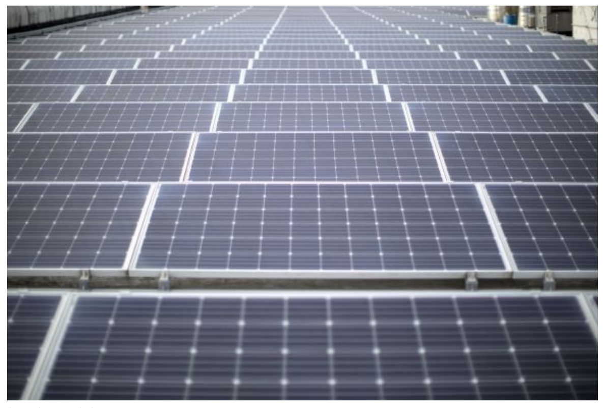
Solar System

Since launching the cooperation between GIZ and the Net-Zero World Initiative (NZW) during COP 28, three cooperation countries were defined: Nigeria, Indonesia and Thailand. In Nigeria and Indonesia local experts where already onboarded to the GIZ project Team "Partnerships to Accelerate the global energy transition" (EM PACT).