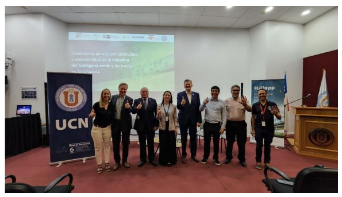
The seminar was attended by representatives from the public and private sector and academia

The seminar "Conditions for the competitiveness and sustainability of the Green Hydrogen Industry and derivatives in Antofagasta", which was organised as part of the International Hydrogen Ramp-Up Programme (H2Uppp), which is commissioned by the German Federal Ministry of Economics and Climate Protection (BMWK) and implemented by GIZ, was held on 24 January in Antofagasta (Chile).