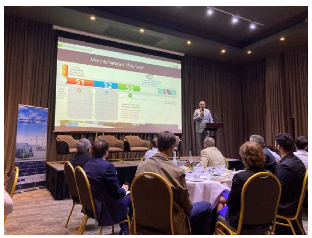
Presentation of the financial service to private sector

The Financial Service Assistance (FSA) was launched on 11 January 2024, with more than 70 attendees from the private sector, identifying the main key factors for the financing and development of green hydrogen projects.