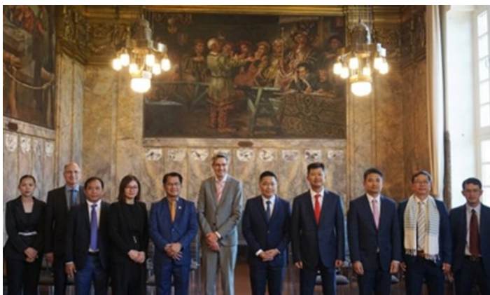
Visit of the Cambodian Competition Commission at the Higher Regional Court in Düsseldorf/Germany.

At the national level, the aim in competition policy to strengthen institutional sustainability by promoting strategic cooperation between competition authorities and key public, private and academic institutions in Cambodia, Lao PDR and Vietnam. This is intended to ensure that the newer competition authorities in particular are perceived as important, competent and effective institutions as quickly as possible.