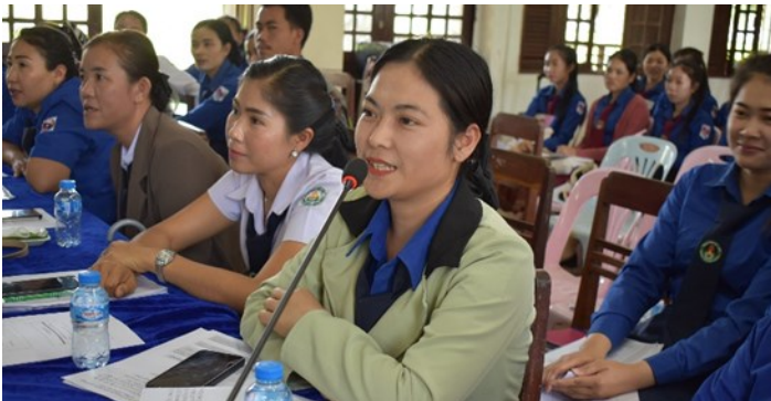
Consultation Meeting on Competition Regulations in Savannakhet/Lao PDR.

The focus of the gender related activities of COMPETE II is to support Member States' initiatives on gender mainstreaming which is in line with the ASEAN Gender Mainstreaming Strategic Framework 2021-2025 . Here the project works closely together with the focal points for gender in the two partner ministries, Ministry of Commerce in Cambodia and Ministry of Industry and Commerce in Lao PDR. New or updated intra-ministerial gender action plans are available in both countries.