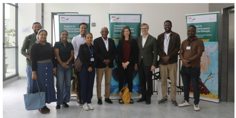
Photo 1: Participants of the DEOW system training in April 2026. This group includes GIZ & CECOE staff who have shaped the digital platform's development since Day 1.

The S2GG programme is implemented by the Deutsche Gesellschaft für Internationale Zusammenarbeit (GIZ) on behalf of the German Federal Ministry for Economic Cooperation and Development (BMZ). The programme aims to gear the Ethiopian governance system towards the transformation into a democratic and inclusive state based on the rule of law.