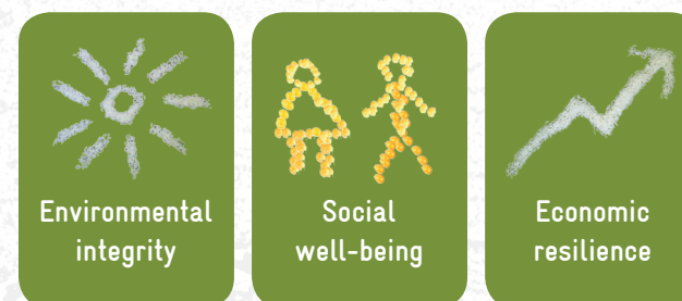
Fig. 2 FAO: Sustainability Assessment of Food and Agriculture Systems (SAFA).

» www.fao.org/nr/sustainability/sustainability-assessments-safa/en