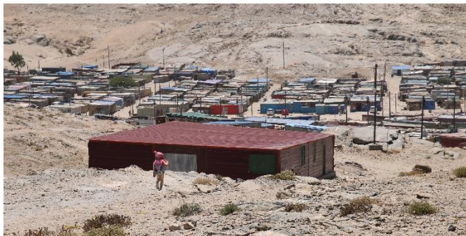
Photo: Informal settlement site in Lüderitz

'We want to be a role model - a case study for urban planners.' In other words: 'We want to do it right and in a way that benefits the people.'