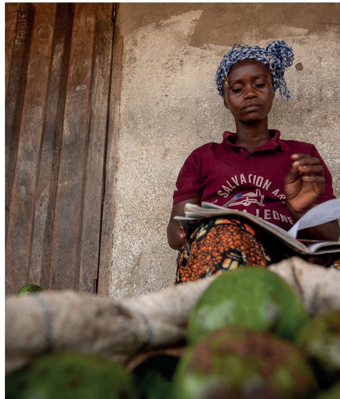
Functional Adult Literacy (FAL) participant

The embedded sustainable livelihoods approach promotes youth employment through local market assessments, private sector partnerships and a dynamic training approach that combines life skills, business skills and labour market integration measures. The component aims to design and implement training modules for 7000 youth in the four target districts of Kailahun, Koinadugu, Falaba and Kono. The youth livelihoods programming is consistent with the prevalent agriculture-based economy and addresses the needs of both vulnerable populations and youth-run businesses.