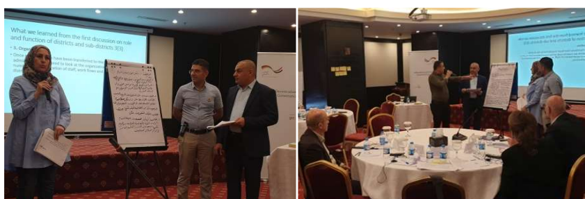
Photos: More than 700 executive staff and civil society representatives were trained in decentralization reforms, feasibility studies, local budget, negotiation and conflict resolution, social accountability and gender.

Through technical advisory, for example trainings on decentralisation and local planning, the project supports the Higher Commission for Coordination among the Provinces (HCCP) in monitoring the progress on decentralisation as well as Governorates in improving their planning capacities.