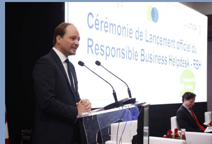
RBH Launch Event in Tunisia.