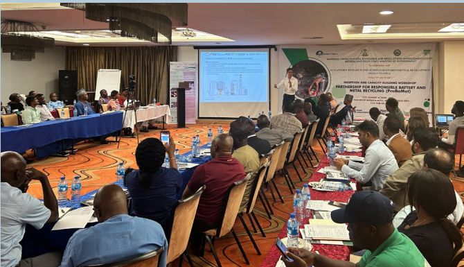
ProBaMet inception workshop with local authorities, regulators, community leaders and recyclers.