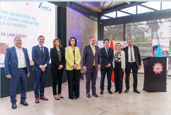
Launch event of the joint Due Diligence project in Morocco