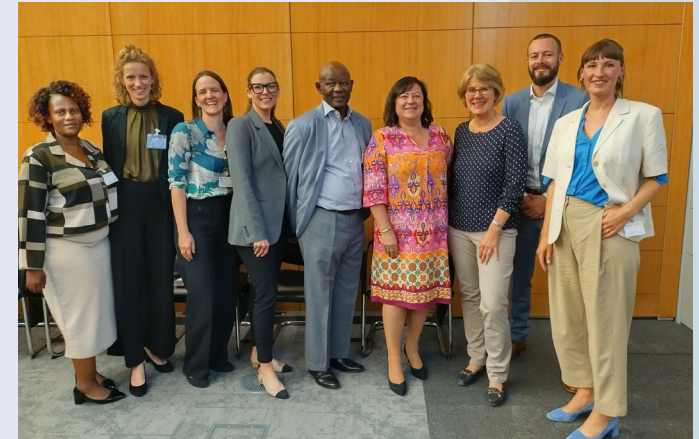
Picture from the OECD Forum in Responsible Mineral Supply Chains in May.

More than 100 stakeholders from the public and private sector as well as civil society actors and trade unions took part in it. The session focussed on effective grievance mechanisms in mineral supply chains providing access to remedy for rightsholders in large-scale mining and included the presentation of a research study on this topic. A panel discussion brought together different perspectives from the the mining industry as well as workers and communities in mining regions.