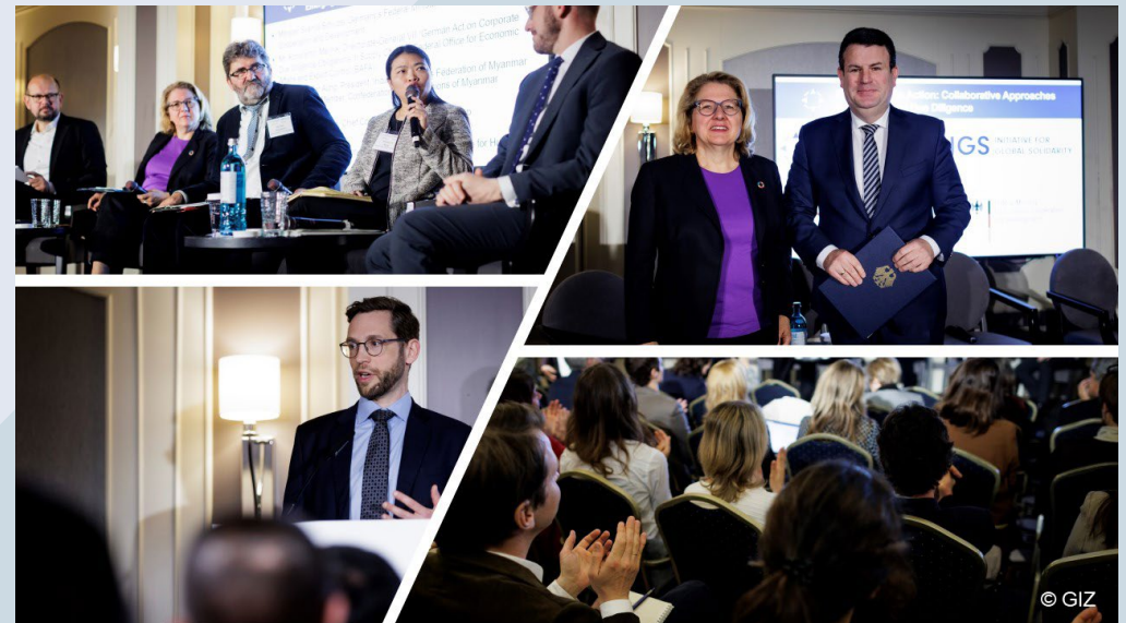
Pictures from the conference „From Policy to Action: Collaborative Approaches to Raw Materials Due Diligence“ on 11th April 2024.

Distinguished panellists from government, private sector, civil society and trade unions discussed how sustainability and resilience in the industry can be strengthened through multi-stakeholder collaboration. The presence of both, Mrs. Svenja Schulze, Federal Minister for Economic Cooperation and Development, and Mr. Hubertus Heil, Federal Minister of Labour and Social Affairs, underscored the growing importance of this issue on the global stage.