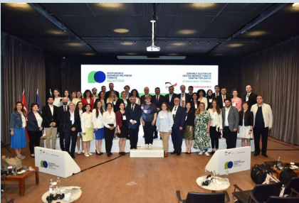
RBH Launch Event in Türkiye.

1,000 companies have already benefited from the advice services offered by the RBH.