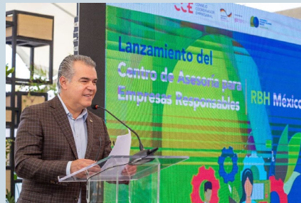
RBH Launch Event in Mexico.