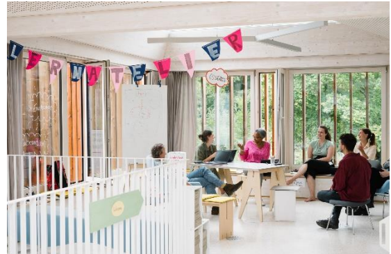
Practice-oriented learning activities in small groups