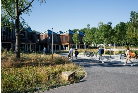
Our training centre: Campus Kottenforst in Bonn-Röttgen