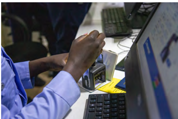
Training for border officials improves the efficiency and safety of entry and exit processes.

In addition, training sessions on Integrated Border Governance were conducted for border officials, both inland and at border points, focusing on migration management, trafficking, and visa processing.