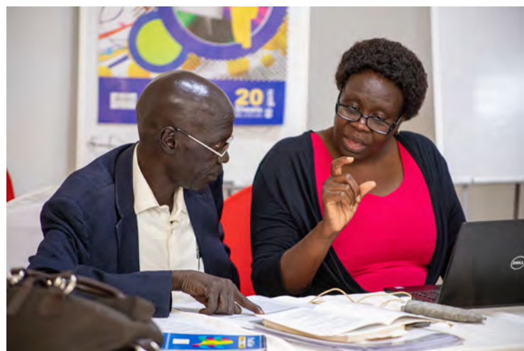
Legal advisory workshop to enhance migration governance.

South Sudan acceded to the UNTOC in October 2023. Building on this success, BMM supports the Counter Trafficking Taskforce in implementing the Palermo Protocol, which is the UN protocol to prevent, suppress and punish trafficking in human beings, supplementing the UNTOC.