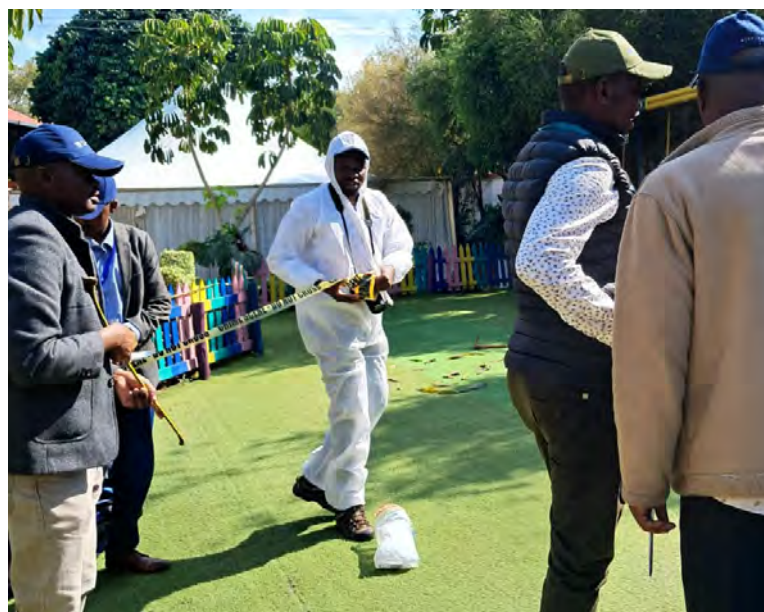
Multi-agency simulation-based training for improved investigation of cases of trafficking in human beings

In cooperation with the Counter-Trafficking in Persons (CTiP) Secretariat and CSOs, BMM provides training for relevant governmental and non-governmental actors on the national referral mechanism to facilitate the referral of migrants to appropriate services, such as shelter, legal aid, medical services and psychosocial support.