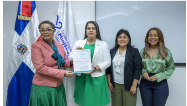
Closing ceremony of the training course held in the Dominican Republic

Published by: Deutsche Gesellschaft für Internationale Zusammenarbeit (GIZ) GmbH Registered offices Bonn and Eschborn, Germany T +49 61 96 79-0 E info@giz.de www.giz.de/en Place and year of publication: Berlin, June 2025