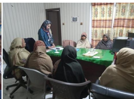
Left: Initial discussion with adolescent girls during a school visit in Skardu