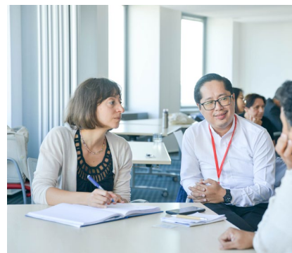
Impressions of the Global Meeting of The RBH Network 2023 in Berlin.