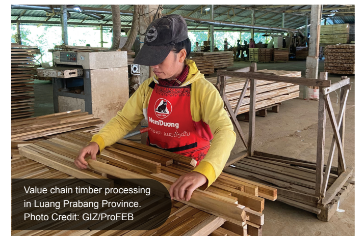
Value chain timber processing in Luang Prabang Province.

The objective is to strengthen sustainable, inclusive, and competitive forest-based value chains. The assumption is that improved access to finance, the promotion of commercial partnerships, and improved relationships among value chain actors at different levels will enhance the market access of MSMEs for timber and NTFPs. This potentially creates incentives for increased participation of local communities in value chains as entrepreneurs and reduces land conversion. It is assumed that forest product processing enterprises with an interest in cooperating with producers will be identified, that financial service providers offer acceptable conditions to producers in rural areas, and that they are willing to include criteria of responsible investment.