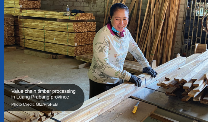
Value chain timber processing in Luang Prabang province