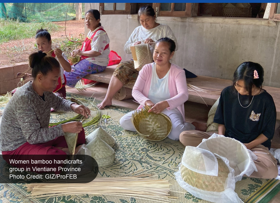
Women bamboo handicrafts group in Vientiane Province

Forests are vital for Laos' rural population, providing essential products such as fuelwood, which constitutes a significant majority (around 80%) of total wood consumption, and industrial wood (around 20%). Beyond timber and fuelwood, forests offer a critical supply of food, medicine, and diverse non-timber forest products (NTFPs) that are indispensable for their income and livelihoods. However, forest-based value chains, including timber and NTFPs, are highly fragmented. Smallholder plantations suffer from mismanagement and lack legal registration, while micro, small, and medium enterprises (MSMEs) face outdated production techniques, limited financing, and poor market access. Companies also struggle with an inconsistent supply of raw material and operate with low technical capacity. Furthermore, challenges in the development, consistent application, and accessibility of comprehensive national standards for diverse forest products impede efforts to ensure consistent quality and fair pricing across the sector.