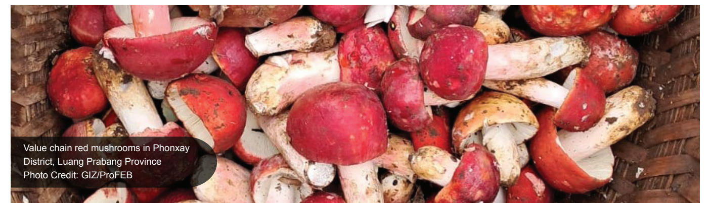
Value chain red mushrooms in Phonxay District, Luang Prabang Province

The ProFEB's value chains output focuses on fostering inclusive, biodiversity-friendly, and deforestation-free forest-based value chains through various strategies. These include promoting new commercial partnerships among value chain actors, such as outgrower schemes. Furthermore, it aims to provide capacity development measures for value chain actors to meet due diligence, i.e., and sustainability standards that equally act on social and environmental criteria. Additionally, an innovation challenge will be organised, with the objective of instigating innovations, increasing value addition, and strengthening the sustainability of forest-based value chains. The innovation challenge is targeting MSMEs, producer groups, Civil Society Organisations (CSOs), government institutions, universities, and other actors involved in forest-based value chains. Finally, the output will strengthen the capacity of provinces to strategically steer MSMEs for more integrated and skilled processing of NTFPs, assess the profitability of MSMEs and forest organisations for bankable projects, and promote income diversification and tree planting incentives for producers.