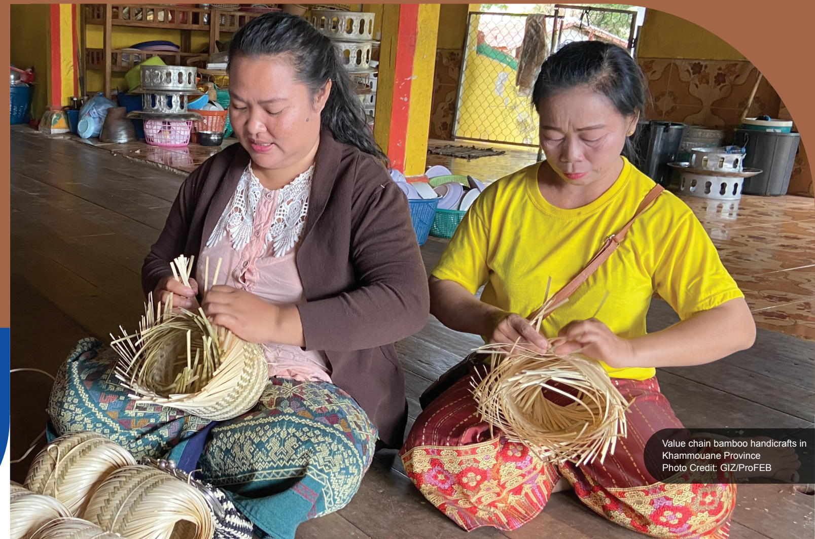
Value chain bamboo handicrafts in Khammouane Province