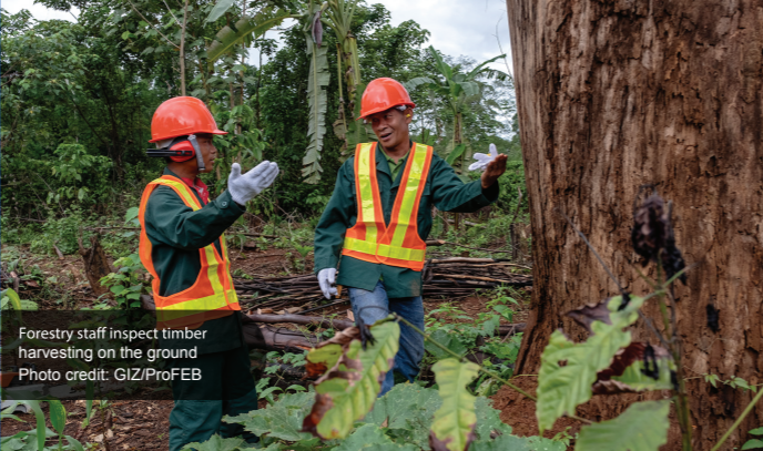
Forestry staff inspect timber harvesting on the ground

Forests are critical for adaptation to climate change and disaster risk reduction, as well as for freshwater supply and management of watersheds. However, from 2000 to 2022, forest cover in Lao PDR has decreased by about 900.000 ha and the National Forest Monitoring System documents a remaining forest cover of about 57% of the land area today (MAF 2022). Given the importance of forests for the development of the country – a large share of the population is dependent on forest resources and hydropower based on water supply is a critical energy source of the country – the Lao government intends to increase the national forest cover to 70% through sustainable forest management as well as reforestation and afforestation measures. To prepare a competitive and sustainable forest sector, improved inter-ministerial coordination is needed on aspects such as land titling in forest areas. Enhanced forest governance, referring to the systems, rules, and institutions that govern forest management, protection, and use, is required with adaptations in the legal framework for FLR and forest-based value chains.