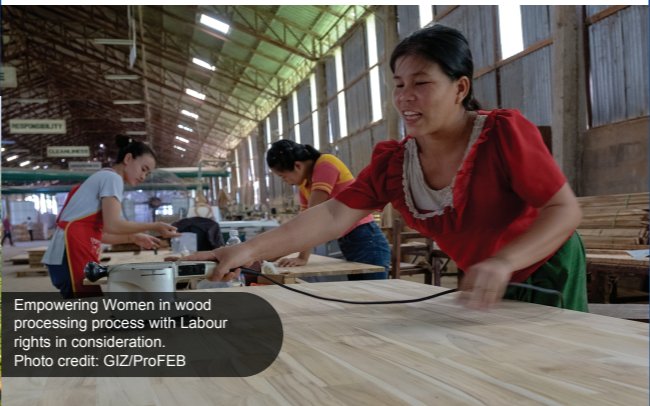
Empowering Women in wood processing process with Labour rights in consideration.

Department of Natural Resources and Environment Inspection (DoNREI) – Ministry of Agriculture and Environment (MAE)