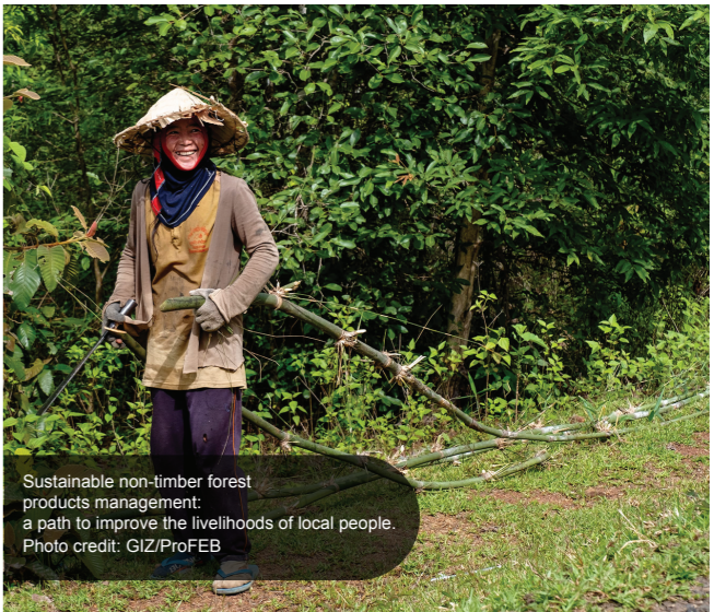
Sustainable non-timber forest products management: a path to improve the livelihoods of local people.

The revision, update, and development of policy instruments, such as the Timber Legality Assurance System (TLAS) and other forms of legislation, belong to the forest policy team's expertise. The piloting of selected policies on the ground feeds into the exchange and enables more comprehensive forest governance. Additionally, the forest policy team supports the Lao government in building on the achievements of the FLEGT VPA negotiations through continued dialogue with the European Union on forest sector development, considering the EU deforestation regulation (EUDR).