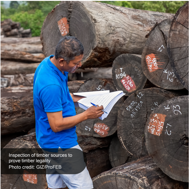
Inspection of timber sources to prove timber legality