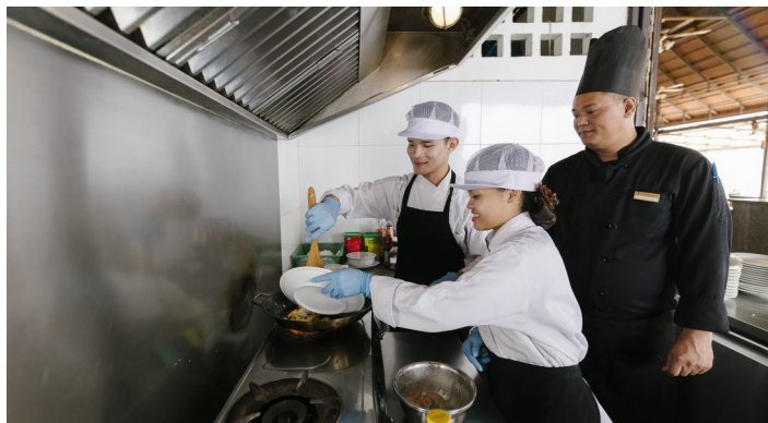
In-company trainer supervising students while they practice in the Food & Beverage Service & Food Production Professional course.

VELA II (2019-24) has successfully established partnerships between 4 TVET institutions and over 150 companies to offer DCT courses. To support these efforts, a DCT Service Centre was created at the LNCCI to boost company involvement. Key achievements include certification system for training companies, training of in-company trainers, introduction of a career guidance system at the supported institutions including a digital aptitude test (OASA) for young and developing national occupational standards. The Vocational Education Development Institute (VEDI) has also enhanced teacher skills through new training programs, including a studio for digital teaching materials. The project has also promoted Green TVET through teacher training and a new online course on sustainable hotel and restaurant management.