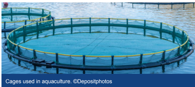
Cages used in aquaculture.

The initiative develops and implements sustainable and inclusive upgrading strategies for selected aquaculture and fisheries value chains using a participatory and systematic approach. The value chains are selected for their potential to generate income, especially also for women. At present, ProsperAzul focuses on three key value chains: