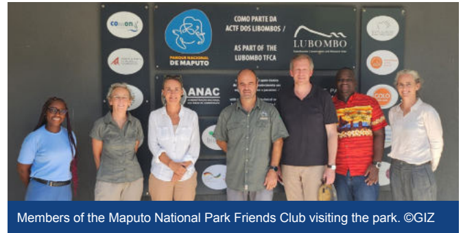
Members of the Maputo National Park Friends Club visiting the park.

Together, these partners support community co-management of marine resources, the development of co-management plans, greater private sector engagement, and the mobilization of alternative financing, including opportunities enabled by national legislation. Through this partnership-driven model, ProsperAzul promotes inclusive governance, sustainable resource use, and long-term financing of community-led conservation and restoration initiatives.