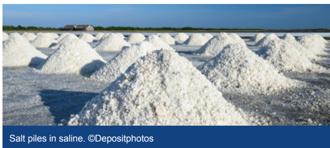
Salt piles in saline.

Farmed tilapia has a strong market potential and the ability to contribute to food security and income generation.