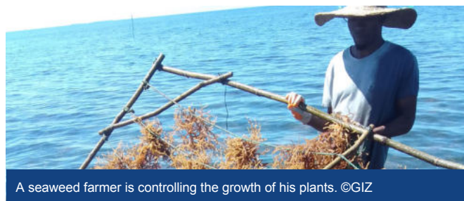
A seaweed farmer is controlling the growth of his plants.

Sea salt production, concentrated in Nampula, Inhambane, and Maputo, is vital to both national consumption and export income generation.