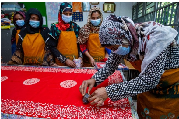
A group of women is learning boutique printing to start their own business.

Inclusive and gender-responsive training and employment opportunities for women and people with disabilities from the informal settlements are being established in private companies in the vicinity of the selected cities. In view of the major challenges, companies and municipal administrations are actively involved in the development of pilot initiatives and resilient concepts to sustainably improve the corresponding offer and access opportunities.