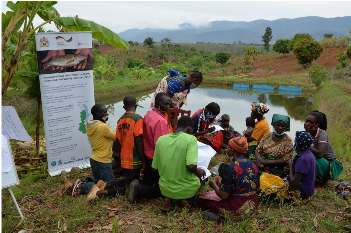
Mdimwa Fish Farmer Group drafting a constitution in Rumphi district, Northern Malawi